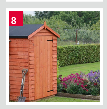
You have successfully installed your Rubber Roof Kit.