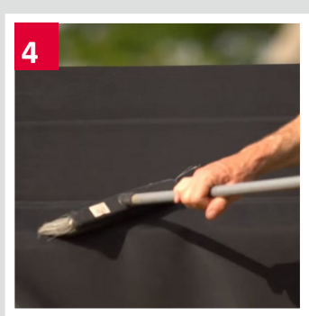
Put membrane on and sweep down to ensure all trapped air bubbles are removed and membrane bonds to the adhesive.