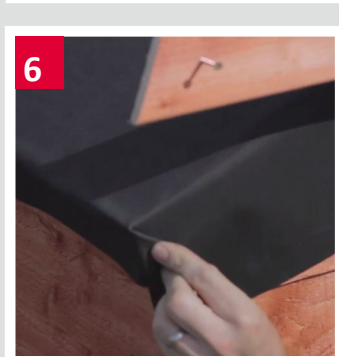
Replace any existing timber barge boards to help secure the membrane perimeter.