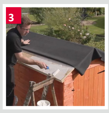
Apply the adhesive working from the centre of the roof outwards in stages. DO NOT let the adhesive dry out.

Relax the rubber membrane by laying it in position on the roof for at least 20 minutes.