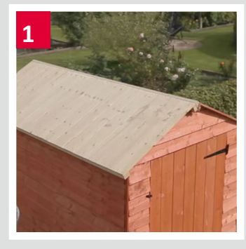
Remove the old roof covering and any nails. Replace the roof boarding if the roof is damaged of if the roofing felt does not come off.